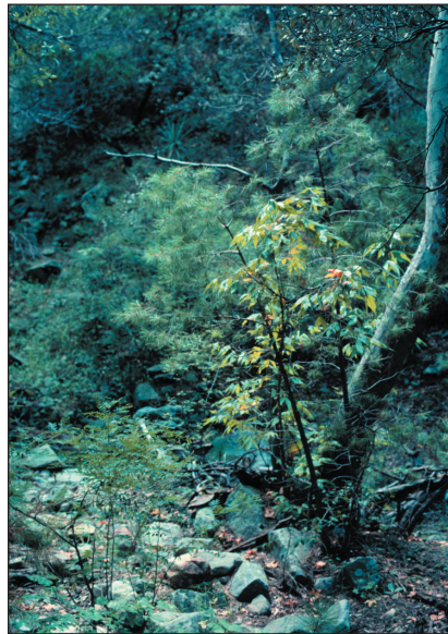
C. David Bertelsen

Habitat: in pine forest on moderate to steep slopes, 5,000-6,000 ft (1524-1829 m) elevation.