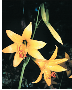
C. David Bertelsen

Habitat: Mesic, shady canyon bottoms along perennial streams or adjacent hillside springs; growing in sandy, saturated soils high in organic material, 5,500-7,800 ft (1675-2375 m) elevation.