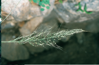
C. David Bertelsen

Habitat: oak woodland and riparian scrub, growing in seeps on bedrock on rocky slopes and cliffs in canyons, 3,520-6,000 ft (1073-1829 m) elevation.