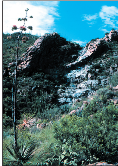
C. David Bertelsen

Habitat: oak woodland and riparian scrub, growing in seeps on bedrock on rocky slopes and cliffs in canyons, 3,520-6,000 ft (1073-1829 m) elevation.