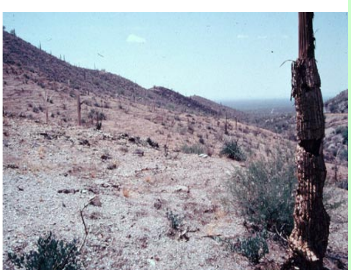
The scene after an exotic grass-fueled fire.