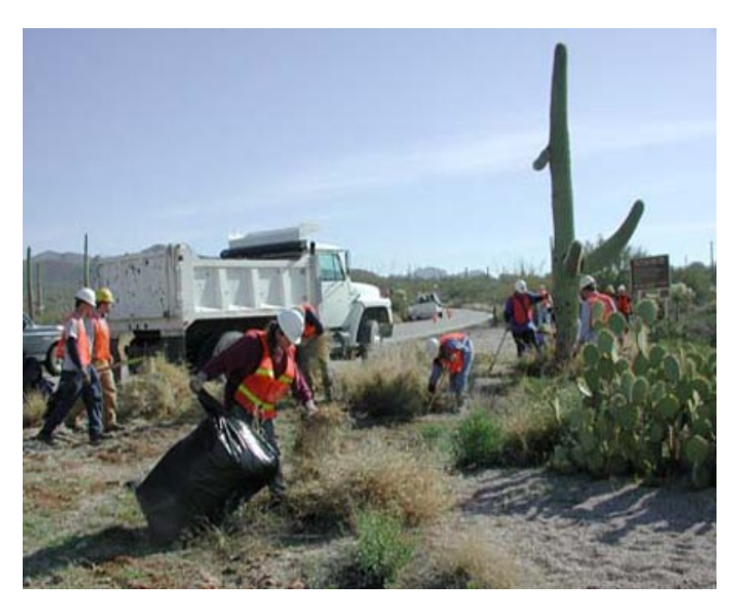
Volunteers spend hundreds of hours removing buffelgrass by hand from Tucson Mountain Park and Saguaro National Park.

After removing buffelgrass, consider planting native species in the area so new buffelgrass seedlings will have less room to take root.