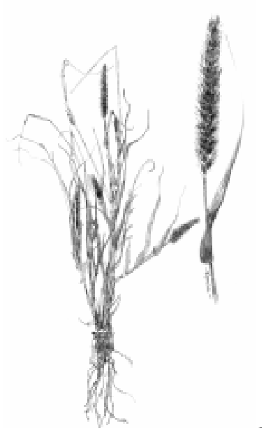
Drawing: Kim Russek

Of the many threats to our native plants and animals, the spread of invasive nonnative species is a great concern. When they invade new areas, they can displace native plants and animals as they compete for ground surface, sunlight, moisture, and nutrients. They can cause drastic changes in the landscape and can affect the entire ecosystem. Invasive grasses tend to provide fuel for fires that destroy the natives. This flyer is one in a series,