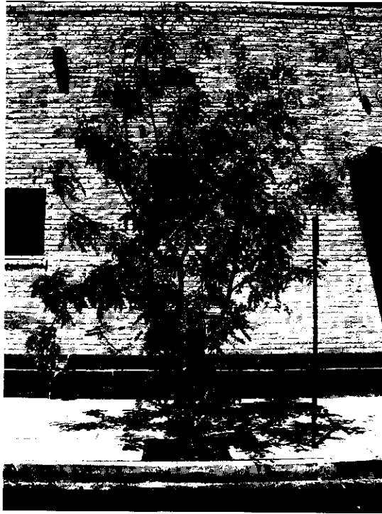
Caesalpinia platyloba : a graceful tree for small areas.

Berberis longipes (Berberidaceae, Barberry Family). Madrean tree mahonia, palo amarillo. Mountain tree 20-30 feet tall with dense, evergreen foliage. Large, pinnate leaves are relatively soft and not spiny. Appears to be slow growing and heat tolerant. Frost tolerant to 20 degrees F. Plant on north side of buildings. Oak woodland.