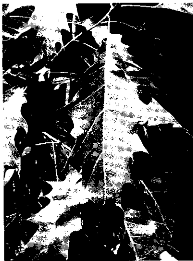
Quercus albocincta : oak often found on hot and dry rocky slopes.

Maytenus phyllanthoides (Celastraceae, Staff-tree Family). Mangle dulce. Thick-leaved, semi-succulent shrub or small tree with crooked branches and trunk. Salt-, drought- and heat-tolerant. Frost tolerant to 20 degrees F. An excellent dense screen or hedge.